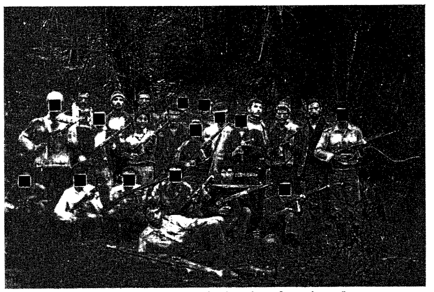
Heroic fighters of Sarbedaran in the jungles of northern Iran.

However, this does not mean that having done all this we would have seized power then. But at least we would have pushed ahead and deepened the class struggle and revolution to the maximum of our ability. Thus the soil would be ploughed and the ground would be more fertile for future battles in a