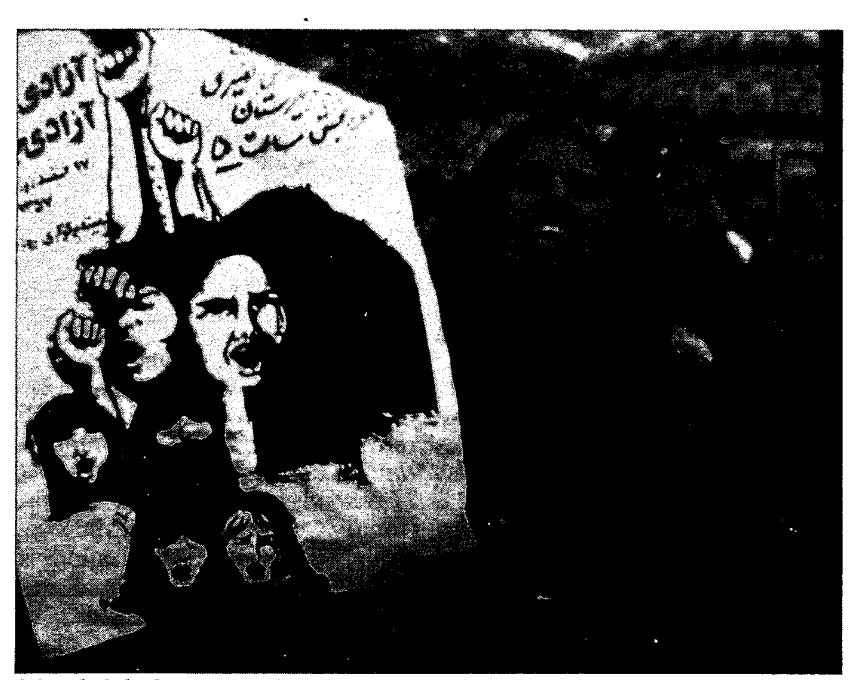
March 8th demonstration in Teheran in 1979.

UIC. What many people, including many advanced know little of, and all the petit-bourgeois and bourgeois forces have kept quiet about, is the vital force of the UIC who continue on the path to communism. Part of this vital force includes a great number of our comrades, from leadership to members and sympathisers, who remained steadfast to their class stand and gave their lives in defense of communism in the dungeons of the Islamic regime. This shows that they were strongly adhering to the principle of rupturing with past deviations and