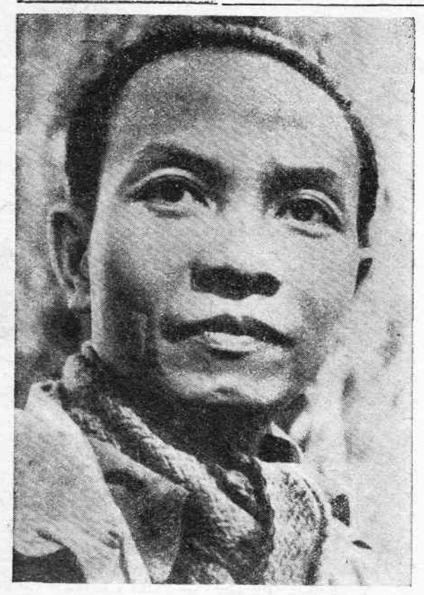
Truong Chinh, General Secretary of the Party

workers and peasants, into the darkest misery. For this reason, the people of Viet-Nam never ceased to struggle for independence and democracy.