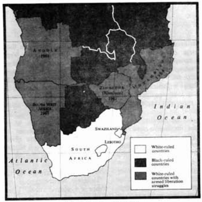
SOUTHERN AFRICA Dates indicate year armed struggle began.

founded. The latter insurance companies were founded as a result of appeals by the Dutch Reformed Church to open new avenues of employment for Afrikaners in the towns and so rescue the "poor whites" from poverty (and the possibility that they might lose their racialism and become militant).