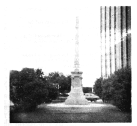
This monument to white supremacy still stands in New Orleans.

One thing is certain: Black Reconstruction and the Paris Commune shared a similar fate — both