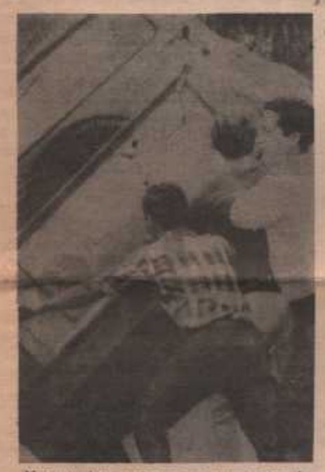
Venezuelan students overturn a trock.

In 1940, Nelson Rockefeller wrote a memorandum to FDR expressing the fear that the US was in danger of losing its political and economic position in the hemisphere because not enough was being done to secure Latin America to the Allied side of the world war. FDR agreed, and $140,000,000 was provided to set up the Office of the Coordinator