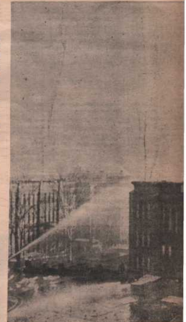
Main University of Tokyo administration building, hel police during heavy campus fighting last week.

This is the context in which the L.A. regional conference will take place January 31 and February 1 and 2 at Pitzer College in Claremont. For further information on the conference, SDSers should call the L.A. regional office: 660-0190. The new address for the office is 619 S. Bonnie Brae in L.A.