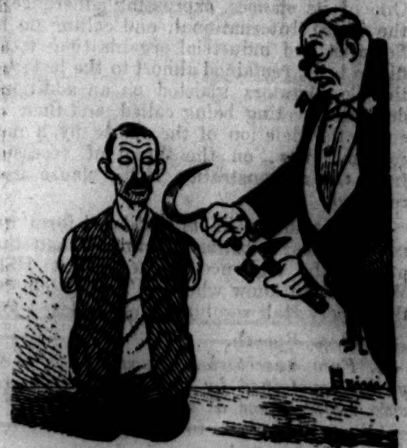
"Yours is not a 100 per cent. disablement."

"That country which makes entire nations into its proletarians, which encompasses the whole world with its gigantic arms, that once already has defrayed out of its own funds the cost of a European restoration, in the very heart of which the class-antitheses have developed into the most pronounced and shameless extreme:—that England seems to be the rock against which all revolutionary waves are broken, and which starves the new society already in the maternal womb. England dominates