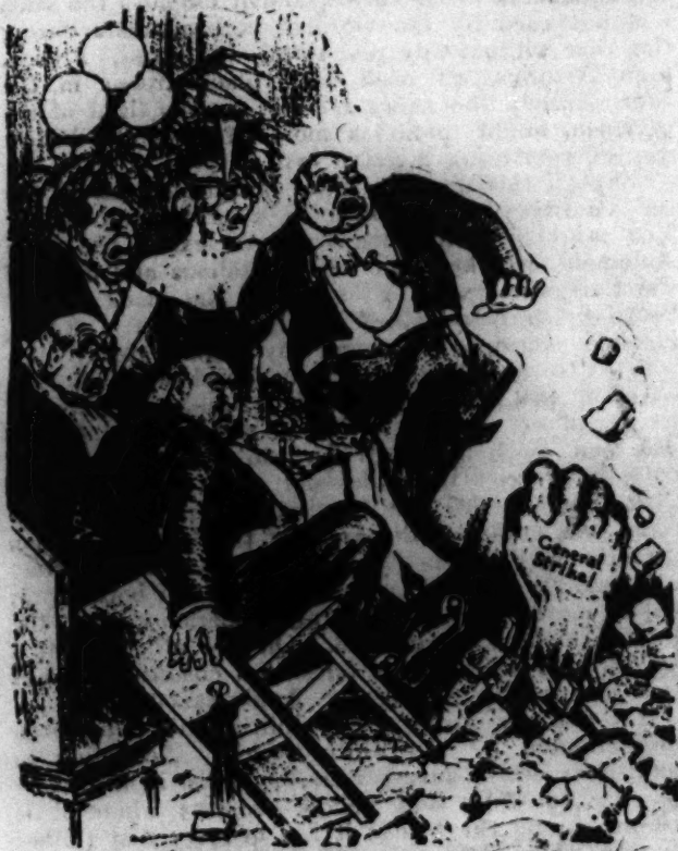
The Hand That Shakes The World.

The working class must strive to render its own piece as large as possible. The capitalist class, with its staff of governors, officials, officers, priests, lawyers, judges, professors, and so on, must strive to prevent this, and to render the pieces A and B as large as possible. There must necessarily be a struggle between the owners and the manipulators of the means of production, even though this is not yet fully realised by the workers, and has only manifested itself so far in suppressed murmurings and dissatisfaction.