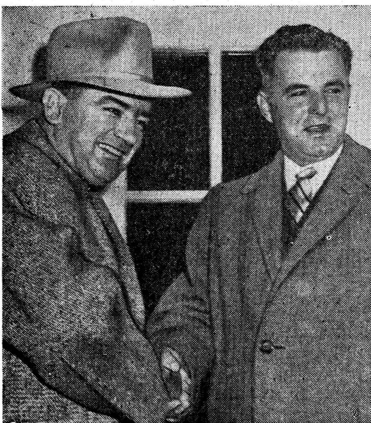
Delighted with the outcome of their conference with Eisenhower and other GOP conferees on 1954 legislative plans, Sen. McCarthy (left) and Rep. Velde, chief House witch hunter, shake hands. The meeting accepted McCarthy's program to intensify the witch hunt. "I wasn't displeased with anything I heard," commented McCarthy.