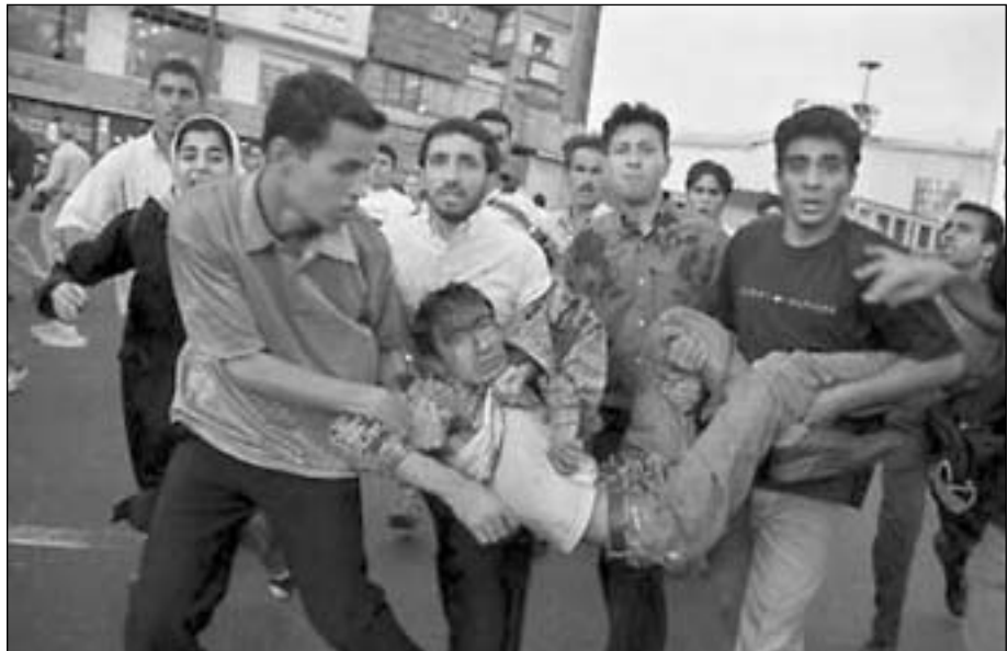
Young Iranian opponents of Islamist regime are brutalized by pro-regime vigilantes, June 2003.