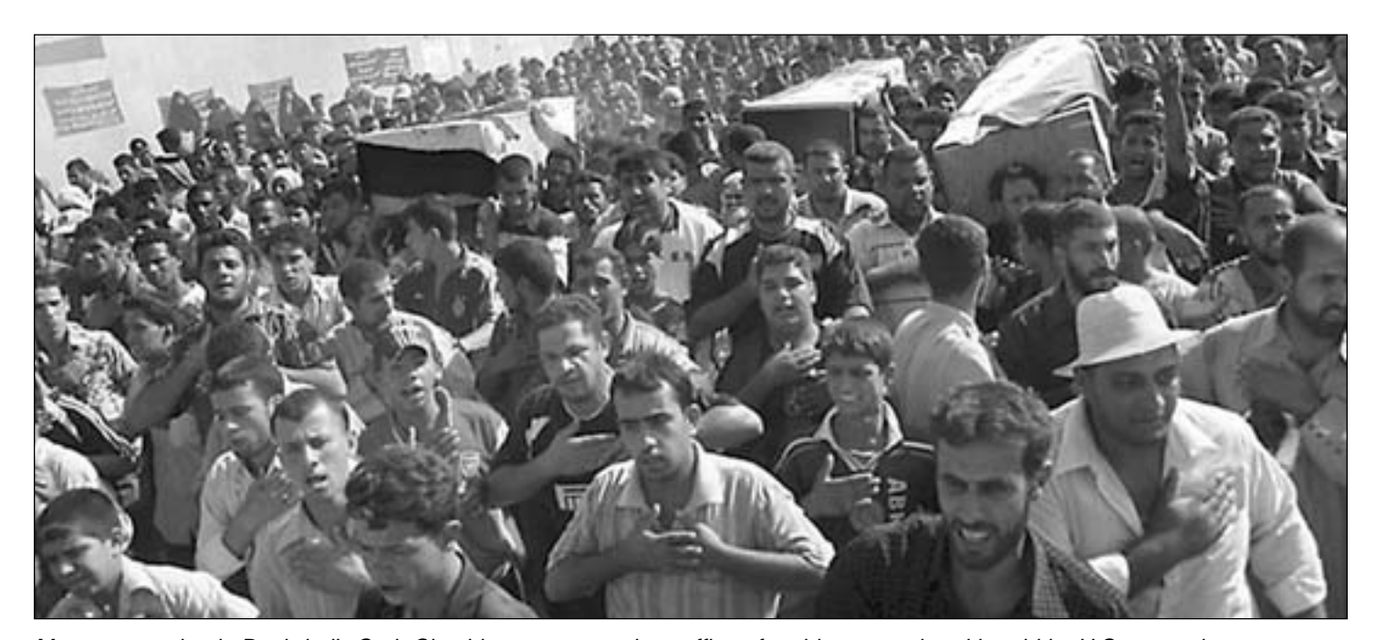
Mass procession in Baghdad's Sadr City this summer carries coffins of residents murdered in raid by U.S. occupying troops.

But now the Democrats are faced with fundamentally the same problem as the White House. The U.S. has already lost the war in Iraq: despite reported military gains, its client Iraqi government is a shambles. The greatest problem for the imperialists now is how to stop the disaster from becoming a far greater continued on page 8