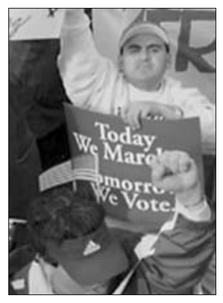
Pro-Democratic Party misleaders foisted an electoral strategy on the movement which paved the way for government crackdown today.

National Council of La Raza Unida (NCLRU), and the League of United Latin American Citizens (LULAC). In Chicago leading STRIVE supporters included the Illinois Coalition for Immigrant & Refugee Rights (ICIRR) and Centro Sin Fronteras. They misled immigrant workers (and some activists in their own organizations) by calling it a step forward. They claimed that it was the best the movement could get in the current political climate – a climate they helped create by derailing the marches.