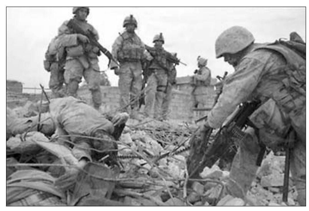
U.S. military devastated the city of Fallujah in 2004. WCPI downplays brutality of imperialism, demands that Iran – but not the U.S.! – "be expelled from the international community."

This is exactly the major argument between us! How can the communist movement become a mainstream movement here? By showing a better alternative than the "Democrats." By organizing people for socialism, not as an ideology but as the only alternative to this dark era. By fighting for "socialism now." By drawing a clear line between all kinds of fanaticism and the socialist project. Like you, I believe that communists in the U.S. are far from this stand.