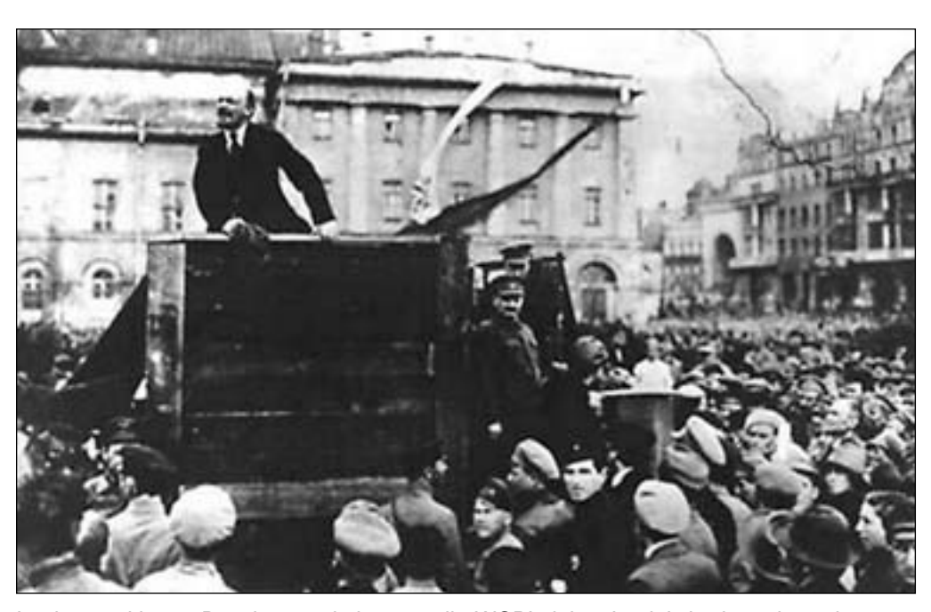
Lenin speaking at Russian revolutionary rally. WCPI claims Lenin's heritage but rejects his support for oppressed nations against imperialism.

Marx and Engels, Lenin and Trotsky all understood that when oppressor nation states waged war on the colonial or neocolonial countries: 1) the masses of the oppressed country would rally to its defense, and communists, wherever possible, had to