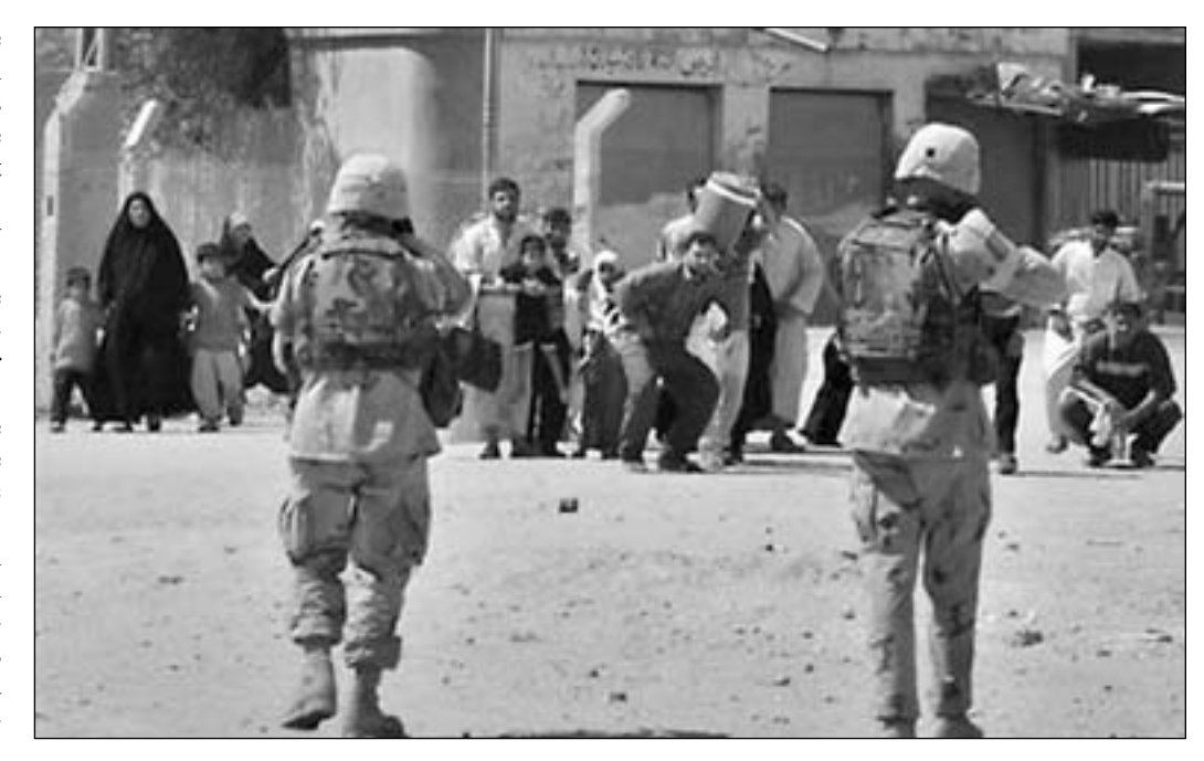
Najaf, Iraq 2004: U.S. troops aim weapons at civilians. Communists stand for defeat of occupiers, but WCPI takes no side between imperialist and resistance forces if U.S. attacks Iran.

We are very happy to engage in a dialogue with you and supporters of the Worker-communist Party of Iran. As communist internationalists, we are well aware of the need for such an important exchange of views. Therefore we accept your proposal for a panel discussion and we gladly agree to participate. Marxists well know that open and honest debate is essential. After all, these ideas at issue between us are life and death questions for not only the workers and oppressed of Iran but for all humanity.