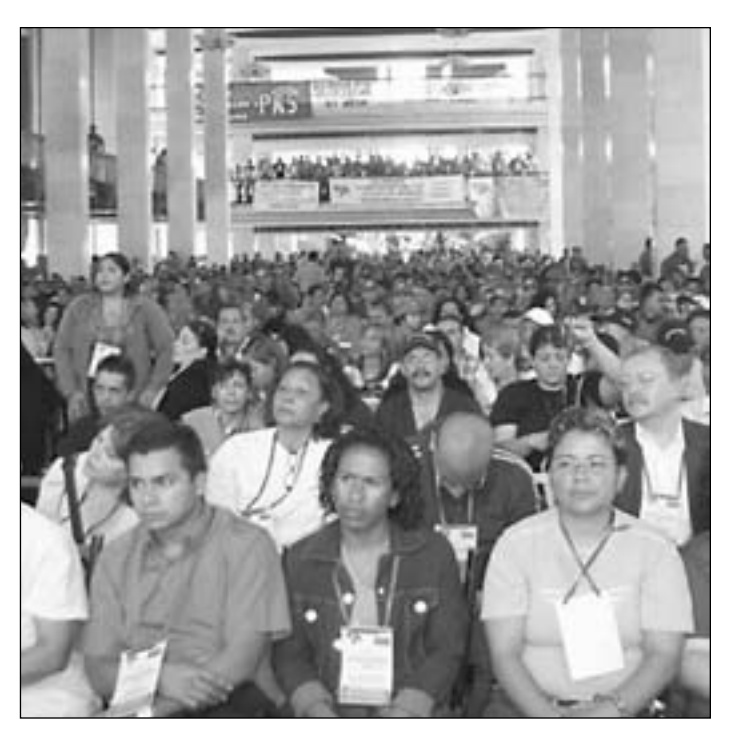
2000 workers came to the 2nd Congress of the UNT in May 2006. Pro-government bureacrats sabotaged union elections, and destroyed the Congress. There is still no elected central leadership, accountable to the ranks.

At the World Social Forum (WSF) held in January 2006 in Caracas and attended by 70,000 people, the JIR also muted its criticisms of the PRS. The PRS had put out a flyer to advertise its forum, "The Bolivarian Revolution and the Struggle for Socialism of the 21st Century: Workers' Power or Class