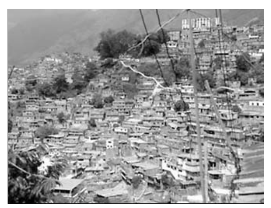
One of the many shantytowns surrounding Caracas. This is the face of 21st Century Capitalism. Despite high oil profits, masses still live in intolerable poverty, with high rates of underemployment and informal non-union labor.

with making it the vehicle for "a big independent party of the working class" – which is what they usually said in their newspaper and leaflets addressed to their fellow workers. (See Double Talk on the Party , p. 28.) It was bad enough that they had been calling on Chirino for months to build the PRS as a mass party. Now the public fraction statement implies that they were hoping to form a revolutionary vanguard party – with these proven class traitors!