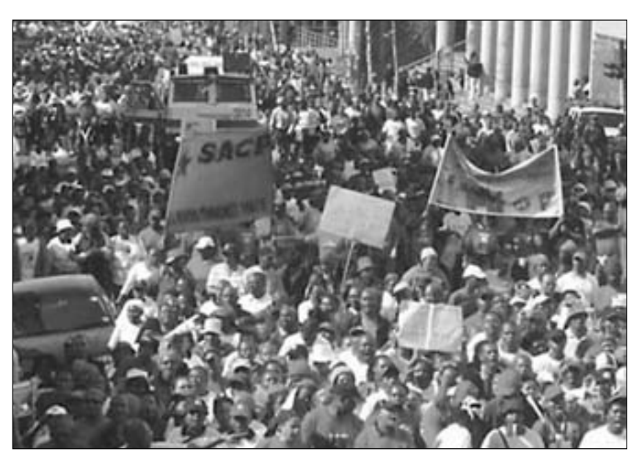
Striking workers in Johannesburg, June 2006. Union leaders caved in to government "allies."

To sell this deal to the masses, this "Congress Alliance" (ANC/COSATU/SACP) promised to radically improve the conditions of the masses: hundreds of thousands of homes would be built, running water, sewage systems and electricity would be brought to millions, education and health care would be expanded and jobs created. Little of this has been done.