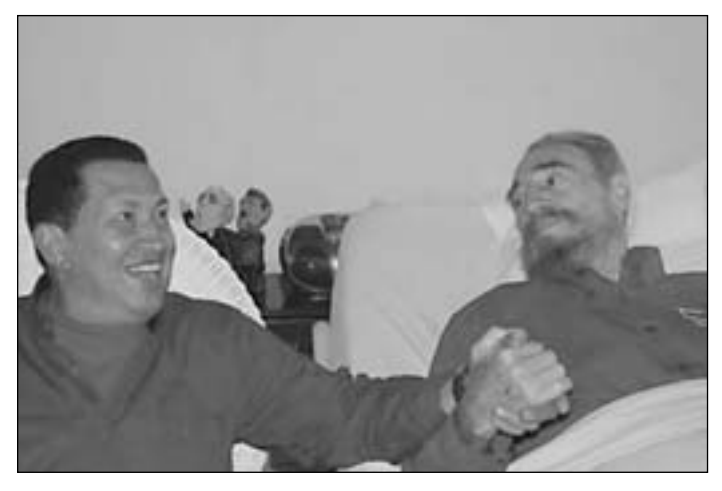
The left hailed Castro and now cheers on Chavez. Permanent revolution rejects nationalism: the international working class must lead the revolution to smash imperialism.

For example, the LIT-PSTU has not renounced a whole history of class-conciliatory politics that characterizes Morenoism. On the contrary, the LIT rests on Moreno's extensive history of political support for bourgeois parties and alliances: Moreno's political capitulations to Peronism in Argentina perhaps being the most infamous example. More recently, in 2002 the LIT-PSTU called for a vote for the popular front alliance in Brazil that Lula's Workers Party had formed with the bourgeois Liberal Party. And most to the point, both the LIT as a whole – and its representation in Venezuela – called for a vote for Chávez in 2006. The FT-CI's section in Venezuela, the Juventud de Izquierda Revolucionaria (JIR), has operated as a public faction within a left grouping called the PRS (Party of Revolution and Socialism). When the JIR opposed the decision of the PRS majority to campaign for Chávez, they reported that "we were