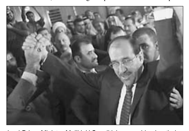
Iraqi Prime Minister Maliki. U.S. politicians are blaming their client's powerless government for political failure of their troop "surge."

Like Baker-Hamilton, the Times expressed the ruling class's dilemma by emphasizing that it opposed "precipitate withdrawal." Rather, withdrawing troops to bases inside Iraq and