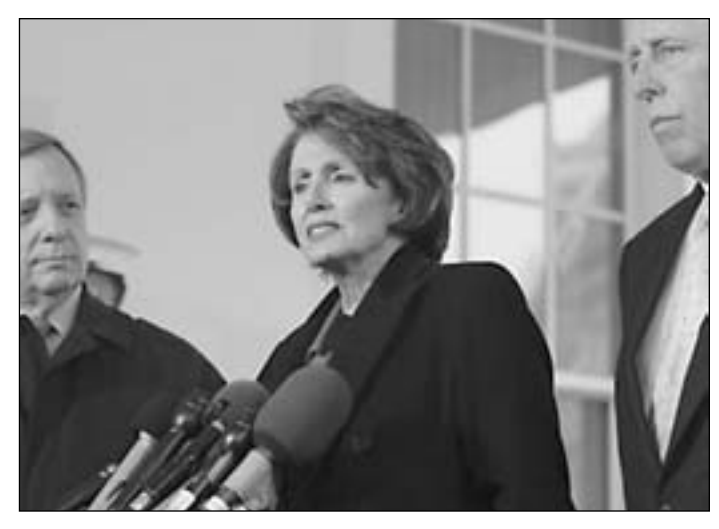
House Speaker Nancy Pelosi engineered Democrats' maneuver that allowed Republican votes to pass war-funding bill demanded by Bush.

at home are not the result of "evil" or greedy individuals. They are inherent in the capitalist system. And in the past few decades of overall economic stagnation, the capitalists have intensified exploitation in an ever more vicious competition for spoils. The only alternative is to overthrow the capitalist ruling classes and their blind, voracious pursuit of profit and to build a classless socialist world.