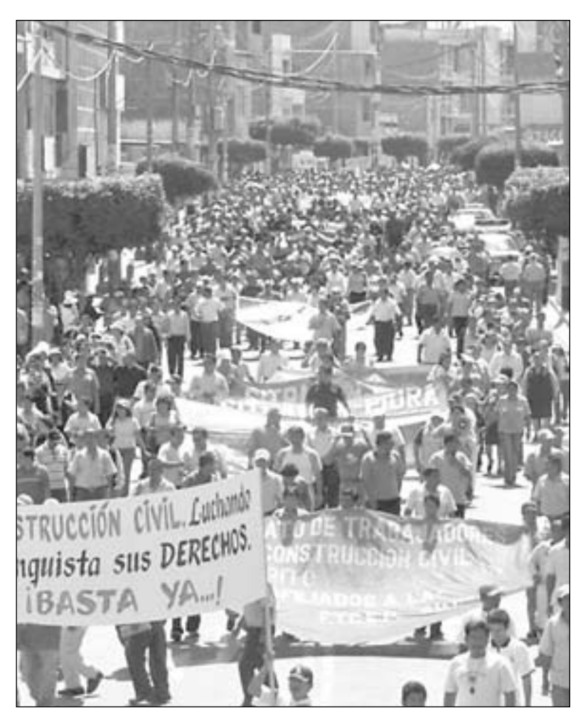
A strike wave in Peru last Spring, the latest in a series of workers' eruptions in Latin America in the past few years. Attacks on union rights and other basic needs of the workers and oppressed is commonplace from Argentina to Peru to Mexico. An international revolutionary party can unite the struggles of workers across the continent.

Further, we do not agree that this tactic, in Venezuela today, would advance the revolutionary cause. There are not thousands of workers moving to break with Chávez. The militant layers have