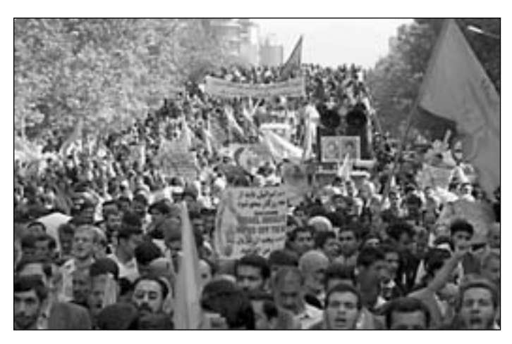
Iranian rally against Israel, 2005. Iranian regime's anti-imperialist rhetoric masks its capitalist exploitation and oppression.

comparison between 'Western capitalism' and its status with the Islamic version of capitalism in this view."