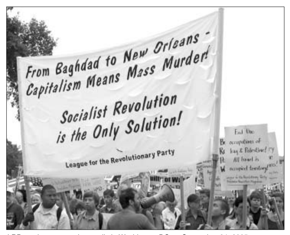
LRP contingent at anti-war rally in Washington DC on September 24, 2005

Katrina washed away much of the veneer covering the true nature of this racist capitalist society. It starkly revealed how Black workers and poor people are still the main targets, not of nature but of continued on page 7