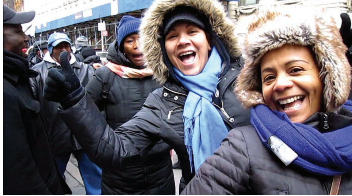
"What do we want? EPP. When do we want it? Now!" Spirited strikers picket DOE, Feb. 6.

These attacks are coming straight from the top, it's not only the Republicans like Bloomberg, it's also coming from Democrats, from Cuomo. Right now they are having accelerated certification of "replacement drivers," i.e., scabs, based on a decision by New York governor Andrew Cuomo, a Democrat who many of the unions voted for. And the attacks on the teachers are coming straight from the White House: the charter schools. the teacher evaluations, the attempts to put in merit pay – all this is coming from Democrat Barack Obama and his "education czar." We have to fight not only against the legal provisions, which are rigged in favor of the ruling continued on page 3