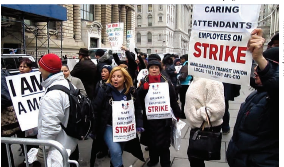
"Who's got the power? We've got the power, union power!" Picket at Department of Education, joined by CWA Local 1180, on Day 22, February 6.

Since the beginning of the year, the billionaire mayor and his schools chancellor continued on page 2