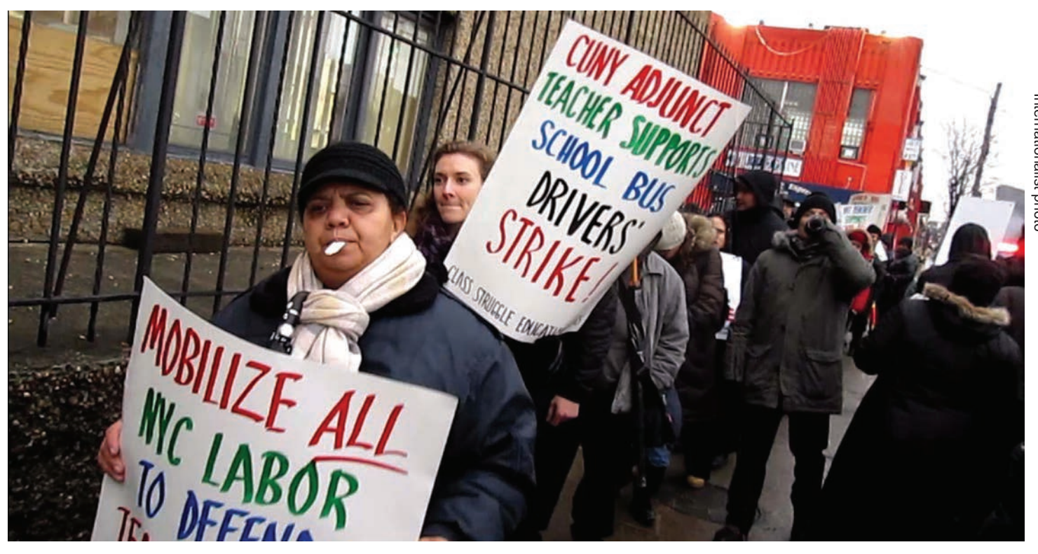
Picket line at Metropolitan Ave., Ridgewood, Queens on Day One of ATU strike, January 16.

Moreover, the sponsors include the Democratic Party in various guises (the City Council Progressive Caucus, Working Families Party, NY Communities for Change). Yet the Democrats from Obama and Cuomo on down are in the forefront of the assault on education unions. And as we have pointed out, Democrats have an overwhelming majority on the City Council - they could force the mayor's hand any number of ways. Instead, the strategy of the union leaderships is to wait out Bloomberg's final term in hopes that a Democratic successor elected in November would be more "labor-friendly." In the meantime, they figure, that could mean taking some