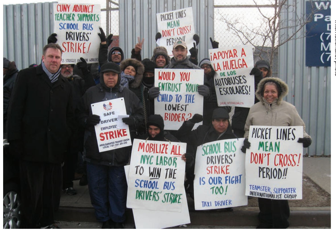
Picket at Zerega Avenue, Bronx, on February 1, Day 17 of the strike. It's cold outside but strikers are all fired up.

The cynicism of the city's ruling class is boundless. Not just the mayor but all of the media. On the day after the ATU