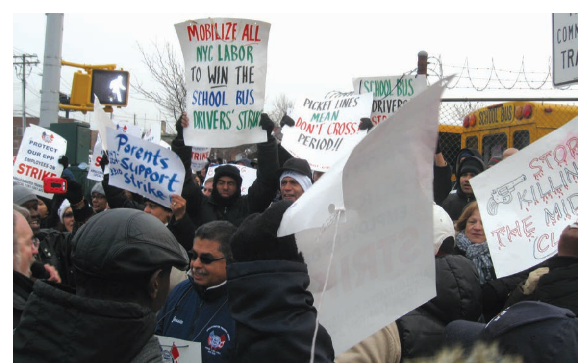
ATU rally together with school bus drivers from Boston (USW Local 8751) and parents, on February 2, Day 18 of the strike. Hundreds turned out for boisterous solidarity rally.

The supremely arrogant Bloomberg doesn't give a damn about the hoi polloi (the common people). He can be defeated, but that requires a leadership that is prepared to fight, and not by the bosses' rules. The UFT leadership hides behind New York's anti-strike Taylor Law as an excuse to cave in. Defying that anti-labor legislation would give Mulgrew & Co. a collective heart attack: their real estate investment in 52 Broadway could be in jeopardy! Now bus drivers may be faced with an NLRB injunc-