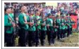
TACTICAL OFFENSIVES NATIONWIDE 9