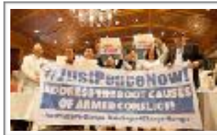
PEACE TALKS SHUT DOWN BY DUTERTE 7