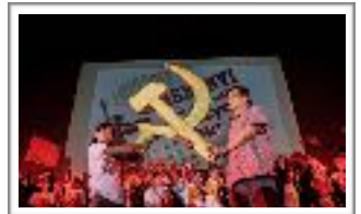
OCTOBER REVOLUTION CENTENNIAL 13