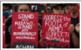
SCHEME OF FASCIST DICTATORSHIP 4

Published by the International Office of the National Democratic Front of the Philippines