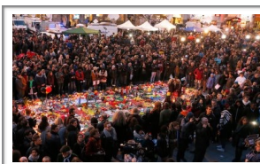
ON THE BRUSSELS BOMBING 11