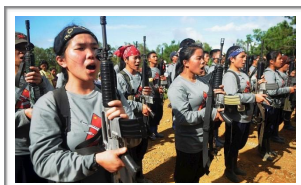
WOMEN'S DAY COMMEMORATION 7