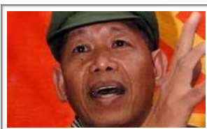
VOICE & SYMBOL OF THE REVOLUTION 9