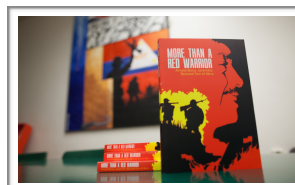
MORE THAN A RED WARRIOR 16