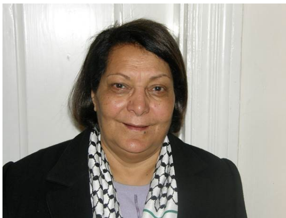
Leila Khaled gave a rousing and inspiring anecdotal presentation of the Palestinian people's revolutionary resistance.

Other performances included a choral interpretation of "Awit ng Tagumpay" (Song of Victory) and rousing rap numbers. The cultural performances were capped with the singing of the "Internationale". ■