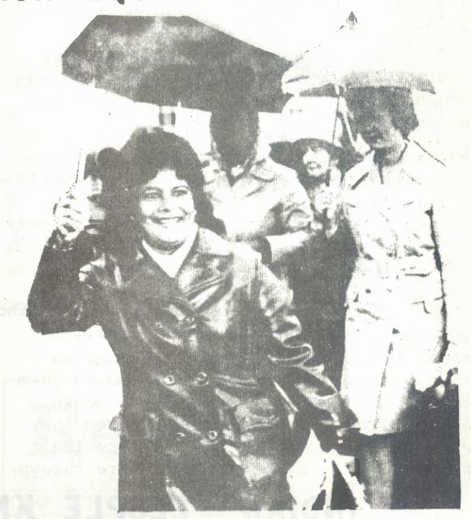
Victorious Trico workers returning to work after winning their 21-week strike for equal pay.

The workers didn't just have to fight the bosses. The 'Equal Pay Tribunal' ruled that there was a 'material difference' in conditions between men and women workers. A placard on the picket line showed the workers' reaction: