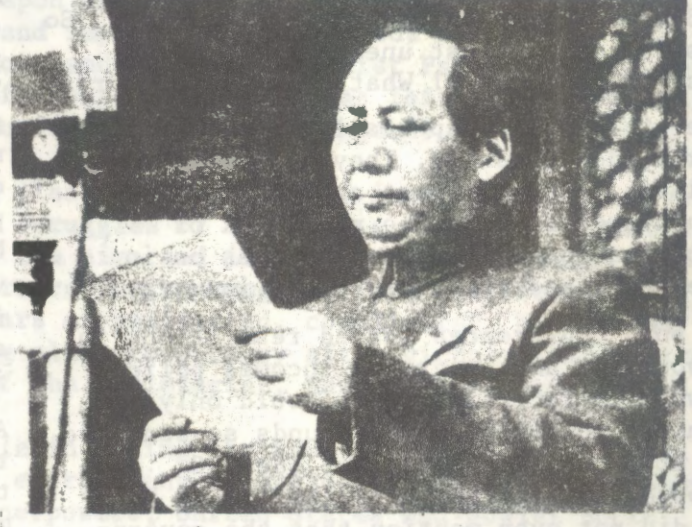
announcing to the world the founding of the People's Republic of China.

JOURNAL OF THE NATIONAL COMMITTEE OF THE COMMUNIST FEDERATION OF BRITAIN (MARXIST - LENINIST