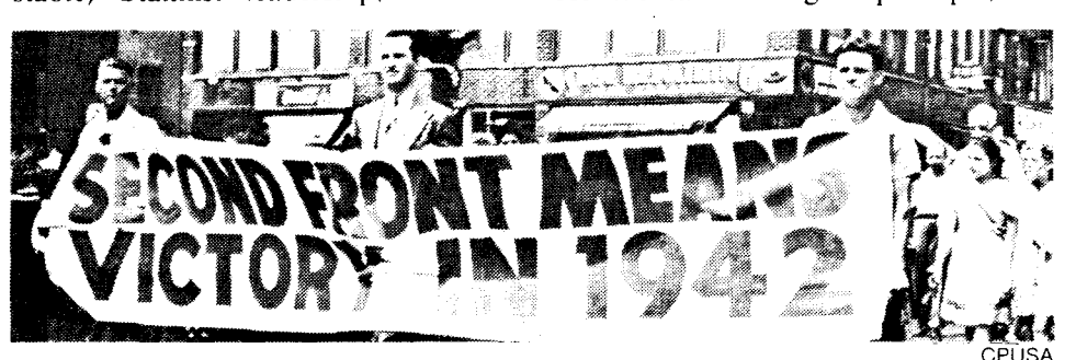
During World War II Communist Party called on American imperialism to open "second front" in Europe against Nazi Germany.

national independence was justified because Georgia had become a base for British incursions dangerous to the embryonic Soviet state. Anticipating Mao by half a century, liberals and social democrats in the West denounced the conquest of Georgia as "red imperialism," as the expansion of the "new tsars." The Bolshevik conquest of Georgia was an unfortunately necessary violation of national self-determination for the sake of higher principle, the