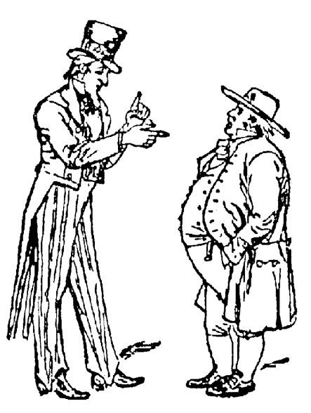
UNCLE SAM & BROTHER JONATHAN