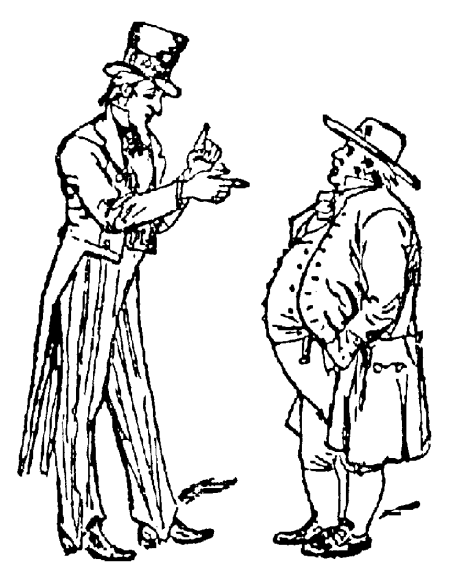
UNCLE SAM & BROTHER JONATHAN

U.S.—You see, this thing of "making people think" is all right enough if it does make people think. But if these strikers remain in the hands of "pure and simplers" they will be told that the strike was lost because the present Mayor of Brooklyn is a Dutchman.