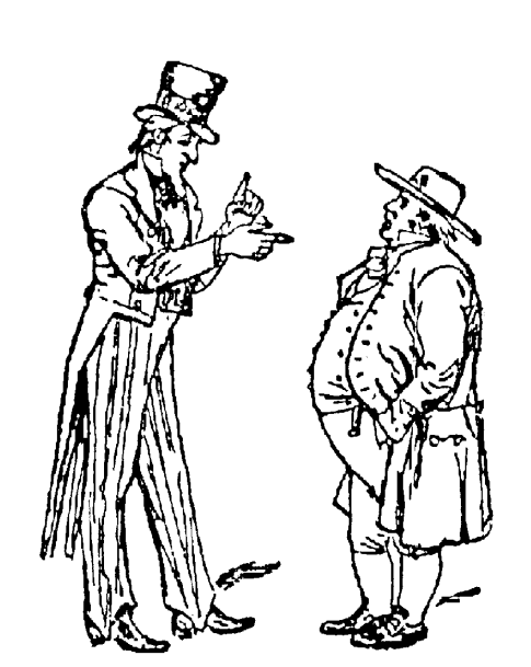
UNCLE SAM & BROTHER JONATHAN